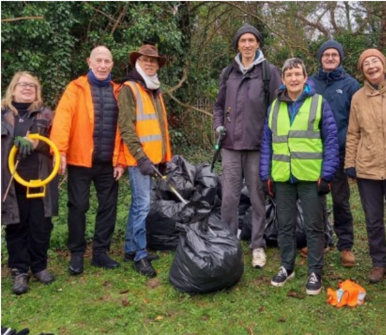
Members of Royston Parish Church at the recent Litter Pick run by the Royston Environmental Group.