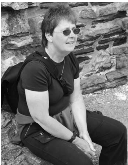
West Wales on my recent holiday

It does mean that our Rogation Sunday Walk (with Quiz and tea) attracted a number of families, such